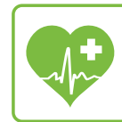
Self - Diagnosis