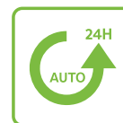
24 Hour Timer